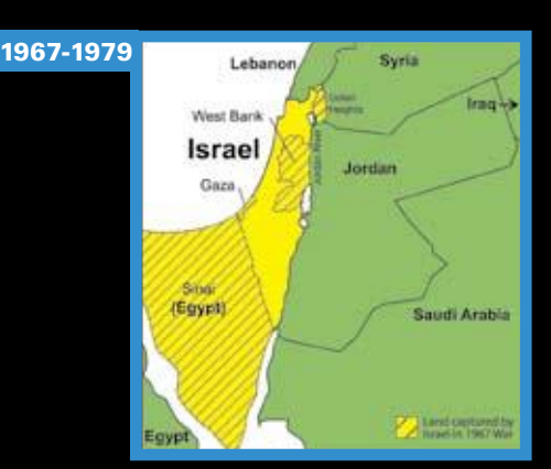
In 1967, Israel fought a preemptive war against the armies mobilized on its borders and captured the Golan Heights, the Sina Peninsula. Gaza. and the West Bank.